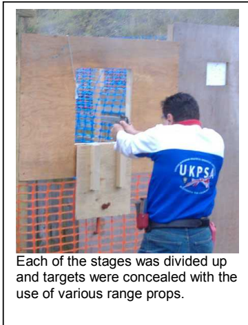
Each of the stages was divided up and targets were concealed with the use of various range props.

The match took place on both the indoor and outdoor ranges with the competitors split into five squads, moving around the stages in