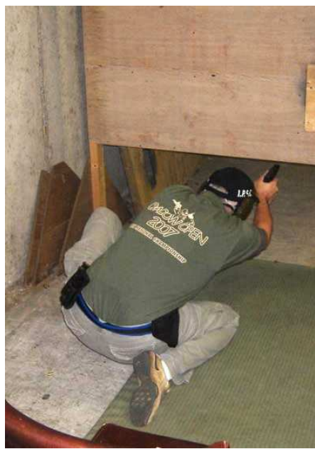
Poland, like all the other emerging eastern European countries are developing new IPSC Regions. Stages were also run on the Kells indoor range.

Kells Rifle and Pistol Club is a combined indoors and outdoor range complex situated on a farm, some 20 minutes drive from Belfast International Airport and 40 minutes from Belfast City Airport. Numerous accommodation facilities and restaurants abound in the nearby towns of Antrim and Ballymena. The clubs facilities are currently being upgraded with a new clubhouse, including disabled facilities, being built.