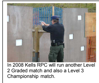
In 2008 Kells RPC will run another Level 2 Graded match and also a Level 3 Championship match.

chronological order. Once everyone had shot the indoor and outdoor stages, the targets and some props were moved around to construct the rest of the stages. The ten courses of fire came to a round count total of 140 rounds; which did not include the misses and no shoots! This was the clubs second graded IPSC Level 2 Match and the Kells match officials did a sterling job in organising and running the event. The assistance of the visiting UKPSA range officials and the work of the local RO's, who had completed a range officer's training course conducted by Martyn Spence, made the competition a smooth running event.